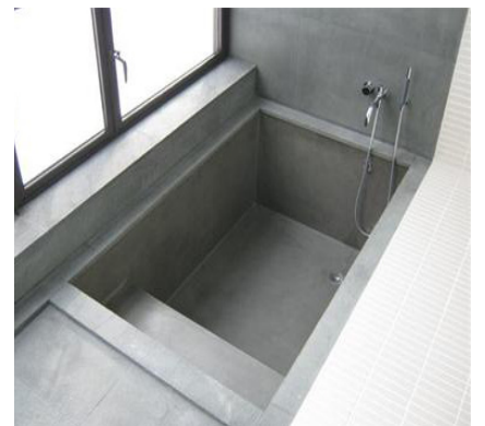
Tubs & showers