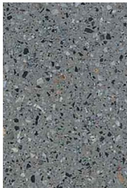
Charcoal exposed aggregate

For more concrete design ideas, visit: www.concretenetwork.com/indoor